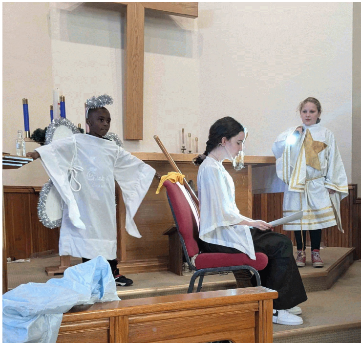
New Beginnings Lutheran Church in Mahomet Illinois

Again, the transference is not that difficult, because all of us have been called. Our calling is to bear witness to Jesus, just as John was called to point people to Christ. In the broadest sense, it's the mission of the Church. We are called to "go into all the world and make disciples" (Matthew 28:19). It's the purpose for which we, as the Church, exist. In