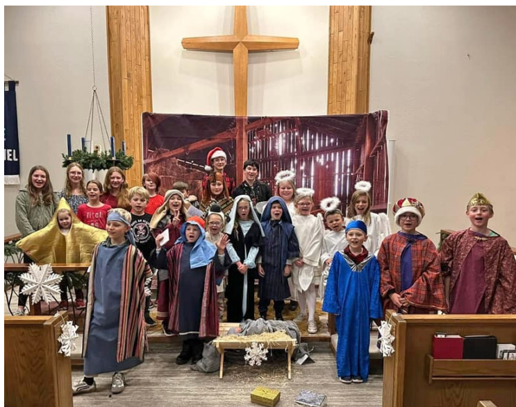
Black Forest Lutheran Church in Colorado Springs, Colorado

Maybe your part is to return to your daily vocation, as they did, "glorifying and praising God for all they had heard and seen" (Luke 2:20).