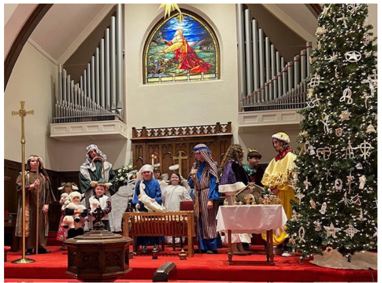
Holy Trinity Lutheran Church in Troutman, North Carolina

Humility before the manger. Humility before the throne. Humility as with the Canaanite woman who wanted her daughter healed but who was blessed to be able to eat the crumbs that fell from the Master's table (Matthew 15:27). Humility as with the publican who went into the temple and prayed. "God, be merciful to me, a sinner" (Luke 18:13). Humility as with the Roman officer who said, "Lord, I am not worthy to have you come under my roof, but just say the word and my servant will be healed" (Matthew 8:8). Or even humility as with Jesus Himself, of whom it was said, "Though He was in the form of God, did not count equality with God a thing to be grasped, but emptied Himself, taking the form of a servant, being born in the likeness of men. And