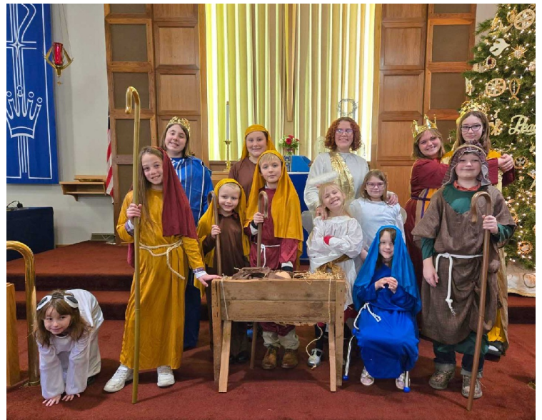
Grace Lutheran Church in Thornville, Ohio

We all had a part to play, whether we liked it or not, even if it was simply singing in the chorus. I remember, one year, wearing a bathrobe as part of the costume. Another Christmas Eve, I remember getting sick and running quickly off stage. Another Christmas, I was one of the sheep. In real life, in relation to Jesus, I still am.