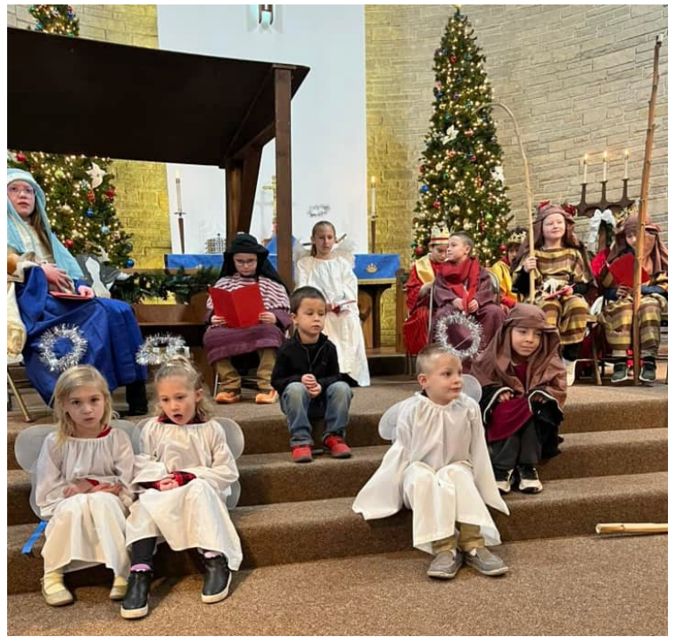
St. John's Lutheran Church of Nekimi in Oshkosh, Wisconsin

Don't let this Christmas come and go without responding in humility to your Creator. The one who made you as you are and who has called you and saved you and given your life real and lasting purpose in Jesus.