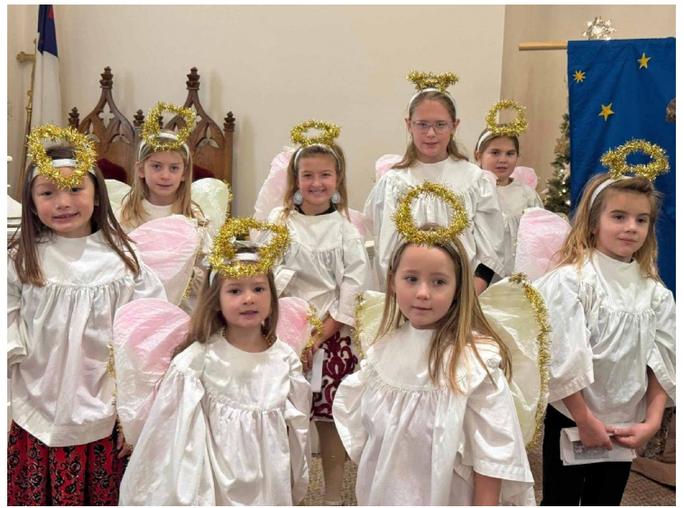
Zion Evangelical Lutheran Church of Metropolitan in Felch, Michigan

the individual sense, the same is true for you. You have a purpose in life and that purpose is to share the name of Jesus with those you know.