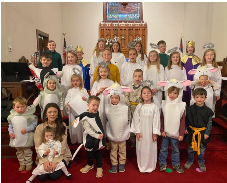
St. Peter Lutheran Church in Chapin, South Carolina

Many of us may never again play a part in a pretend reenactment of that first Christmas story. But all of us have been given a part in the real, down-to-earth