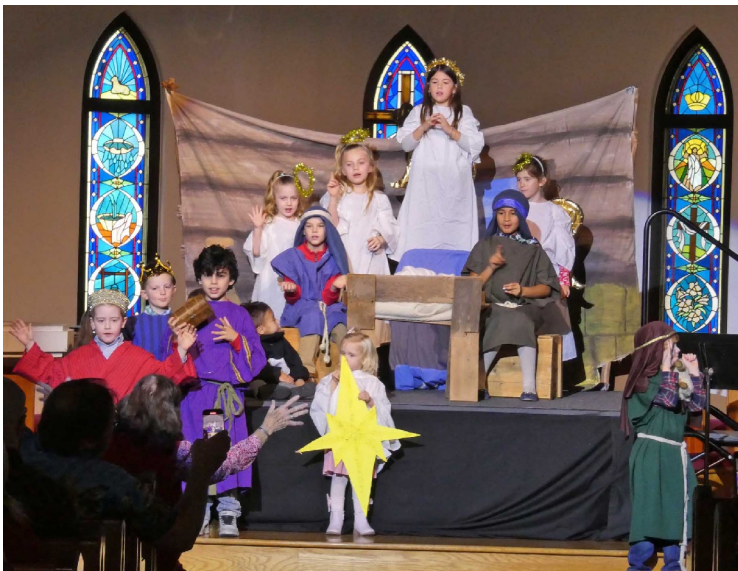
St. John Lutheran Church in Boerne, Texas

Have you ever thought about what it might be like to transfer the Christmas story role-playing of childhood into our adult lives? It's not as complicated a transference as you might think. Just as I used to ask, "What part am I going to be given in the Christmas pageant?" I should now ask, "What part am I now playing in the Christmas narrative in