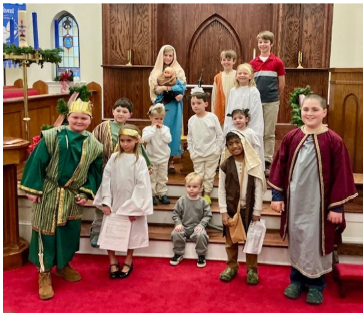
St. Paul Lutheran Church in Pomaria, South Carolina

Maybe we, like the wise men, realize that our own human wisdom is not enough. It comes up short. As a result, we acknowledge our need for God's wisdom. In so doing, we become wise men and women. It says of them, "Then, opening their treasures, they fell down and worshiped him" (Matthew 2:11). Could that be you? Could that be us?