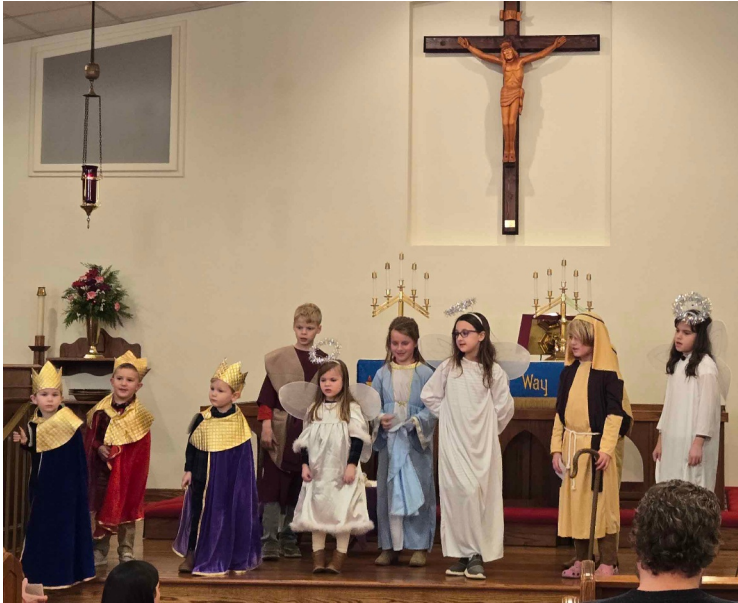
Bethel Lutheran Church in Lincolnton, North Carolina

What is your part? Who, in this story, are you called to be? Who in your life needs to hear what God has done for all of us in Jesus? You may not wear a bathrobe or a scarf or carry a staff or offer gifts. But you have been called. Your part is not pretend. Your purpose is to be the light that points to the True Light.